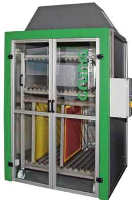
G-DRY 571 Vertical drying cabinet