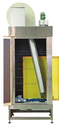
G-LINE 179 IN-LINE Blow off section