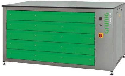
G-DRY 550 Horizontal drying cabinet