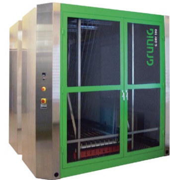
G-DRY 590 IN-LINE drying cabinet