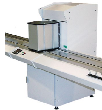
G-LINE 650 IN-LINE drying for CD-feeders