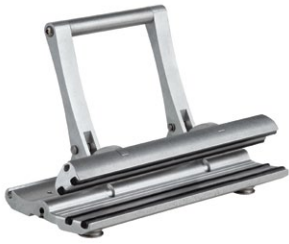
G-STRETCH 201 DUPLEX clamp