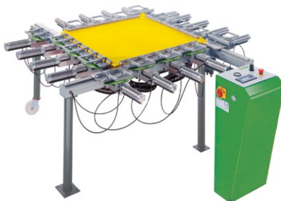
G-STRETCH 215A Pneumatic stretching machine