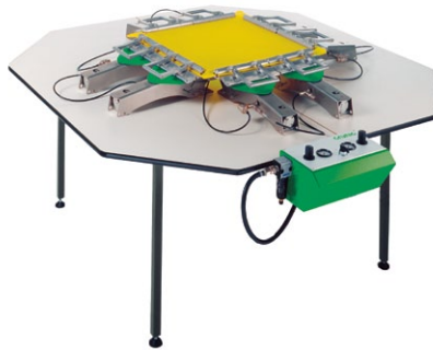
G-STRETCH 202 Pneumatic clamp