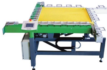
G-STRETCH 270A Electro-mechanical stretching machine