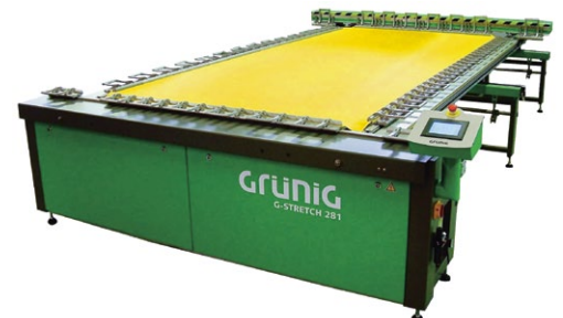
G-STRETCH 281A Multiscreen stretching machine XL