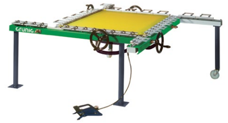
G-STRETCH 210 Mechanical stretching machine