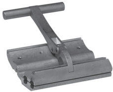
Clamp 125 mm